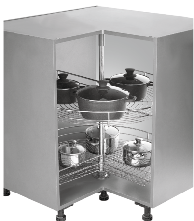
SS BASE CAROUSEL UNIT 3/4 QUARTER SET - 2 PCS