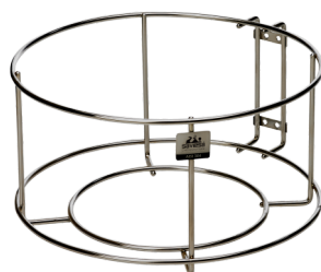
SS DUST BIN HOLDER