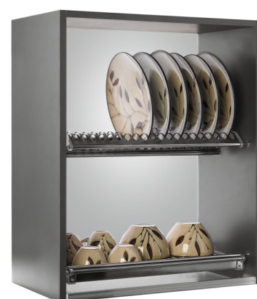
SS IMPORTED DISH RACK