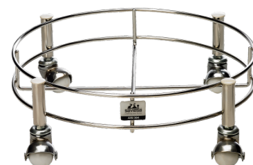
SS ROUND CYLINDER TROLLEY