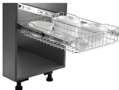
SS CLASSIC PARTITION BASKET