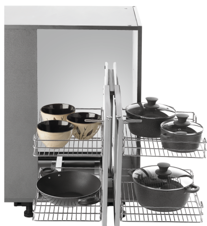
SS GRAND MAGIC CORNER - 4 BASKETS (UNIVERSAL)