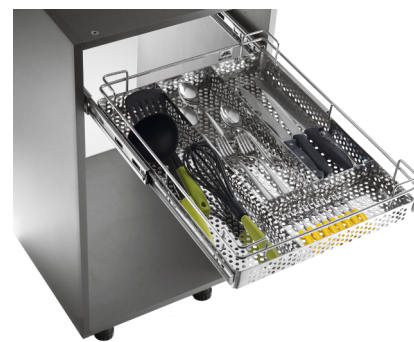
SS ELEGANT PERFORATED CUTLERY BASKET