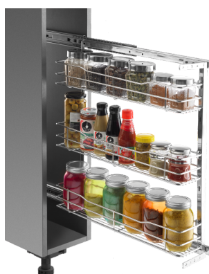
SS POPULAR 3-TIER PULLOUT