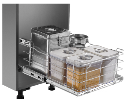
SS GRAIN BASKET