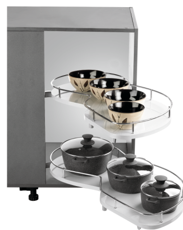
SS SWING CORNER LEFT/RIGHT SET OF 2 PCS