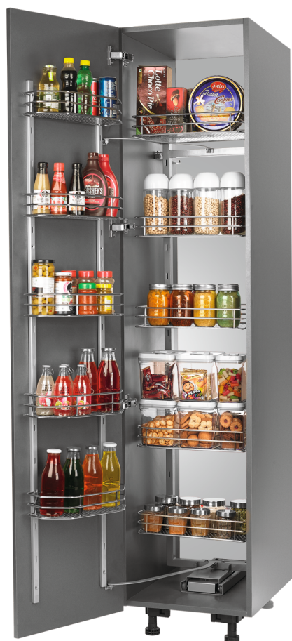
SS ELITE TALL SWING OUT