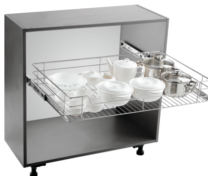
SS VERSATILE PLAIN BASKET