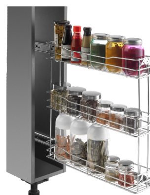
SS POPULAR FIXED 3-TIER PULLOUT