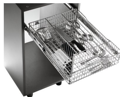
SS CLASSIC CUTLERY BASKET