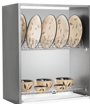
SS DISH RACK