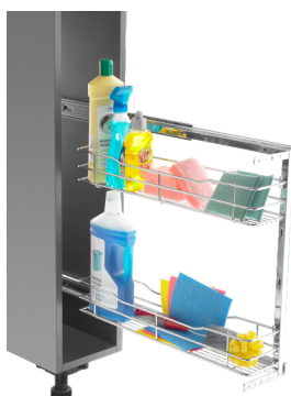
SS POPULAR 2-TIER SINK PULLOUT