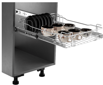
SS ELEGANT CUP & SAUCER BASKET