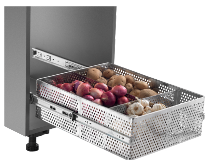
SS VEGETABLE BASKET