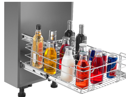
SS ELEGANT BOTTLE RACK BASKET