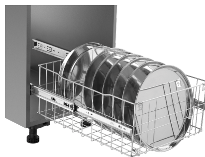
SS CLASSIC THALI BASKET