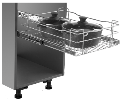
SS ELEGANT PLAIN BASKET