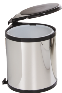
SS DUSTBIN 14L