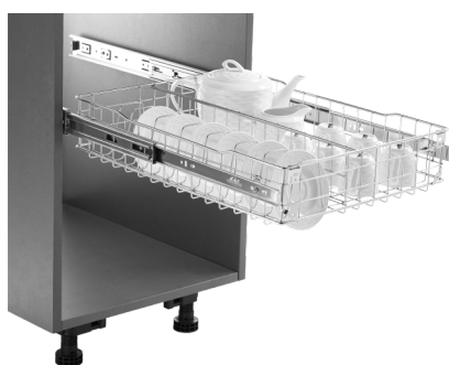
SS CLASSIC CUP & SAUCER BASKET