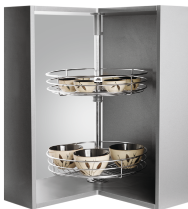
SS WALL MERRY GO ROUND UNIT SET-2 PCS.