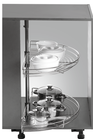
SS HALF-MOON TRAY-SET OF 2 PCS