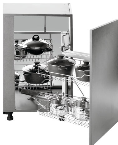
SS ELITE MAGIC CORNER (LEFT/ RIGHT) - 4 BASKETS WITH SOFT CLOSE