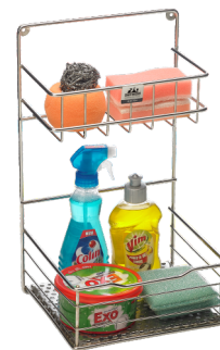
SS MULTIPURPOSE HOLDER