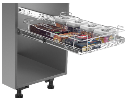
SS ELEGANT PARTITION BASKET