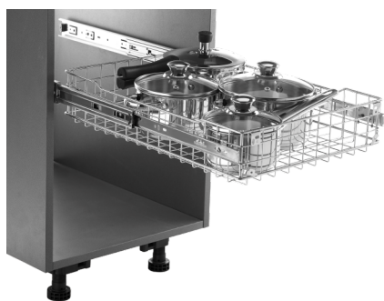
SS CLASSIC PLAIN BASKET