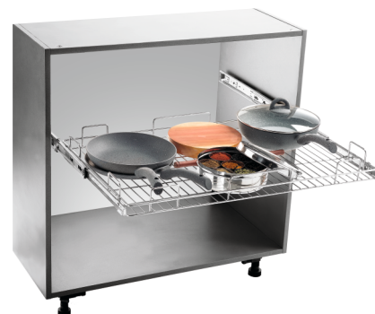
SS SLIM BASKET