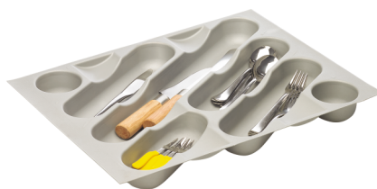
GRAND EXECUTIVE CUTLERY TRAY