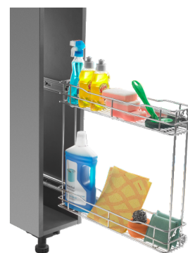
SS POPULAR FIXED 2-TIER SINK PULLOUT